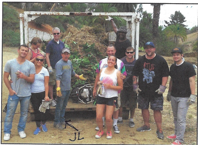
Maple Canyon Friends celebrate a successful cleanup