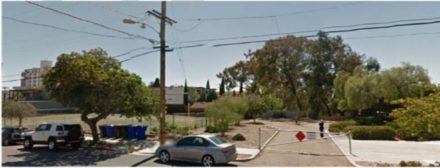
Olive Street at Third Avenue

Up to the amount identified above as the P-4 DIF basis, DIF revenue may provide funding for the design and construction of a pocket park, approximately 0.60 usable acres, which may include a children's play area, picnic areas, walkways, fencing, security lighting, drinking fountains, trash receptacles, benches, and landscaping. This project is located at the intersection of Third Avenue and Olive Street.